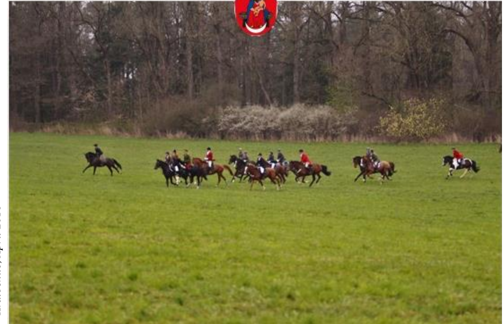
Kratochvíle, April 2016